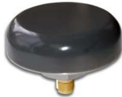
TW3101 Dimensions (mm) Low Profile Radome shown. Conical Radome also available

The TW3101 is housed in a permanent mount industrial-grade weather-proof enclosure and two options for pole mounting are available an L-bracket (P/N#23-0040-0) or a pipe mount (P/N#23-0065-0).